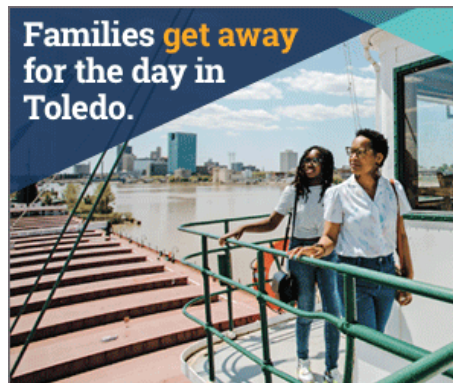
Example: 300 x 250 pixels